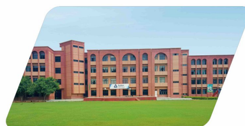
J-1, Delta-2, Greater Noida