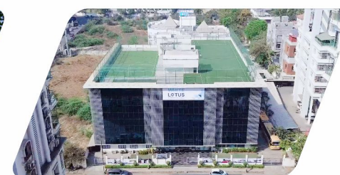
Vesu, Surat, Gujarat