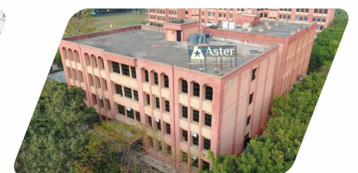
Aster College, J-1, Delta-2, Gr. Noida