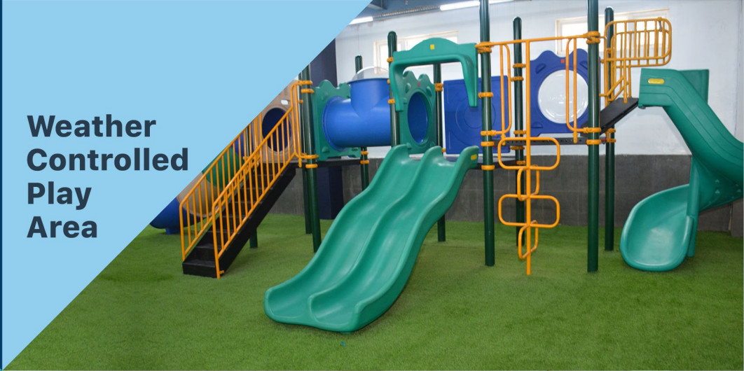
Weather Controlled Play Area