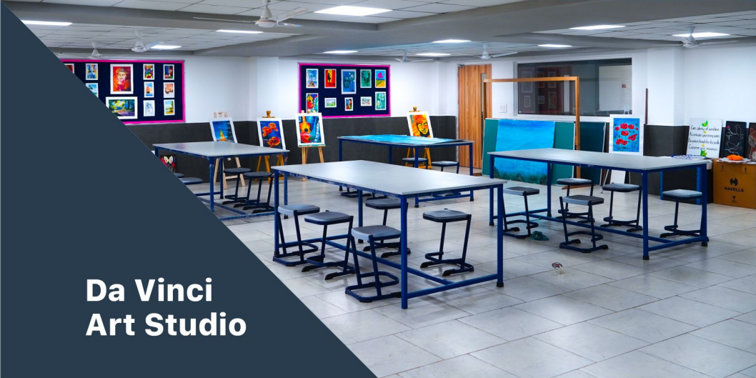
Da Vinci Art Studio