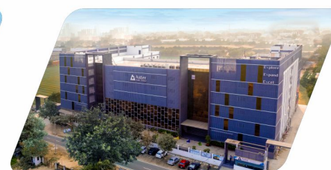
KP-5, Greater Noida (W)