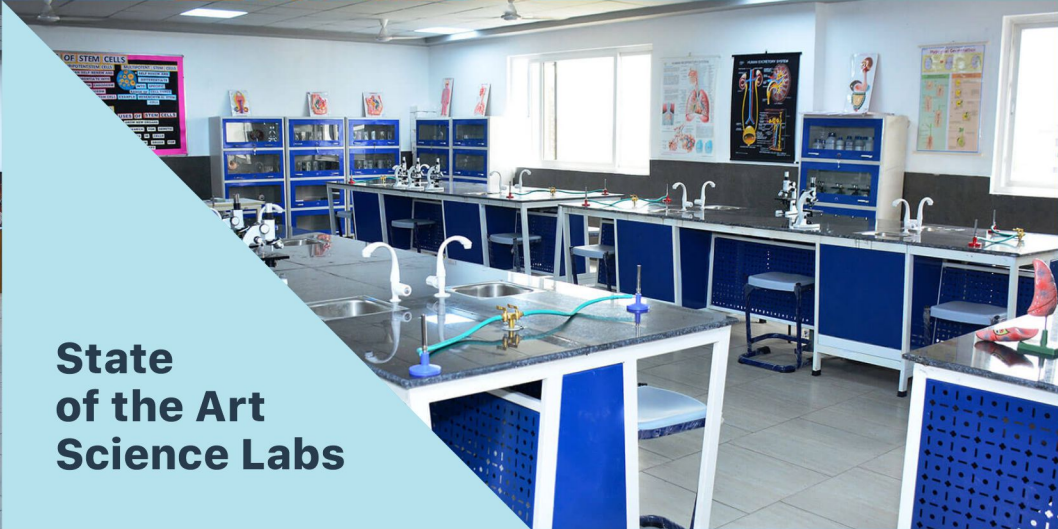
State of the Art Science Labs