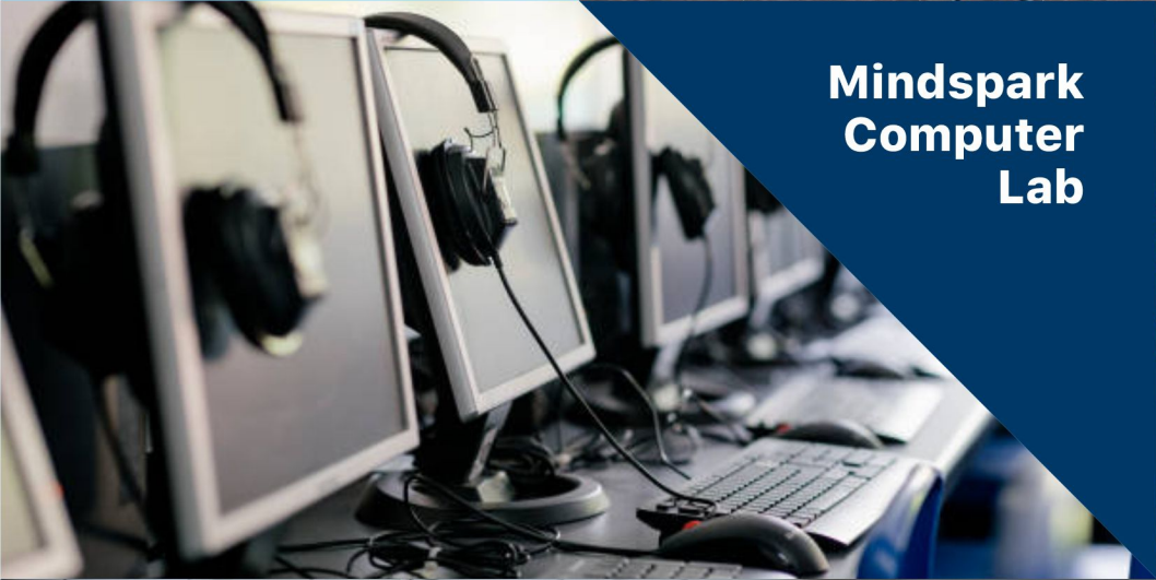
Mindspark Computer Lab