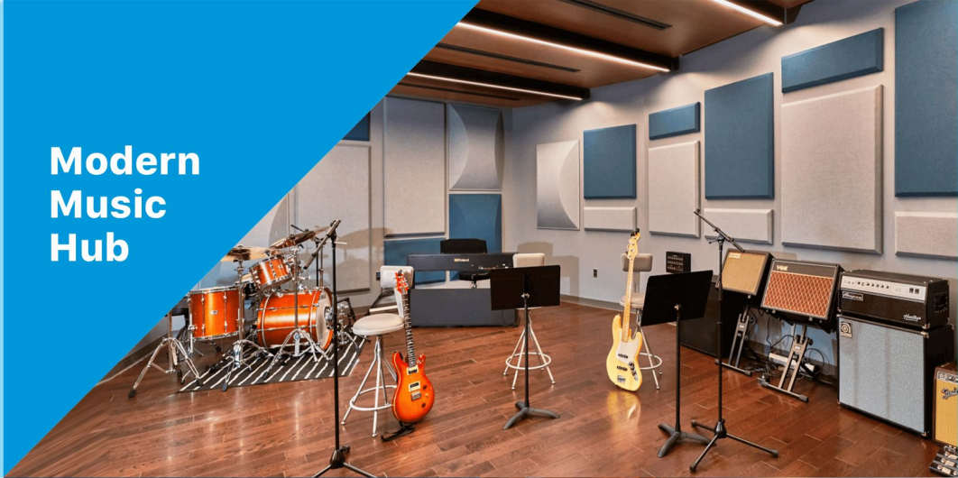
Modern Music Hub