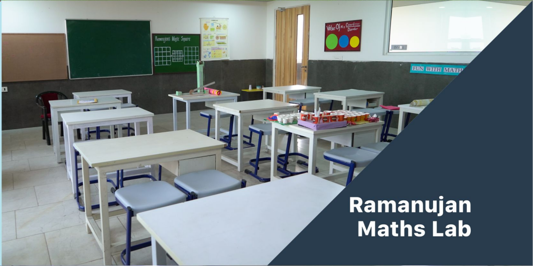
Ramanujan Maths Lab