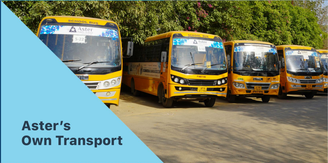
Aster's Own Transport

At our institution, we believe in the power of cultural exchanges to broaden horizons and enhance learning. Through engaging stage performances, students are not only entertained but also encouraged to glean valuable insights from one another, contributing to a dynamic and inclusive learning environment.