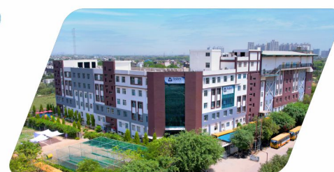
HS-1 & HS-4, Sector-3, Noida Extn.